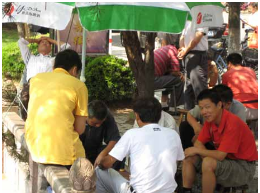
A street scene, Kunshan

I could fret about the fact that Christmas will be here before I know it but I won't do that. It seems to me that spending so much time in prayer is a great way to get ready for Christmas.